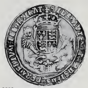
Lot No. 2832